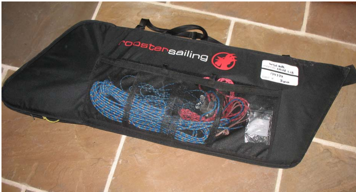
Figure 1: Hire Laser Combi Bag

The parts for the Hire Laser are stored in black Rooster Combi Bags (see Figure 1). The Combi Bags are stored in the sail store. Please ensure that you use the correct bag and kit for the Laser you are using. Do not remove or use items from the combi bag for the other Laser.