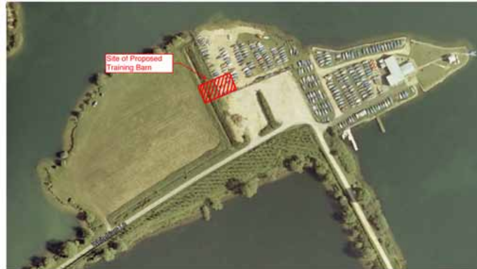
AERIAL PHOTOGRAPH SHOWING LOCATION OF PROPOSED TRAINING BARN

Plans for the Training Barn are on display in the Blue Room of the club house.